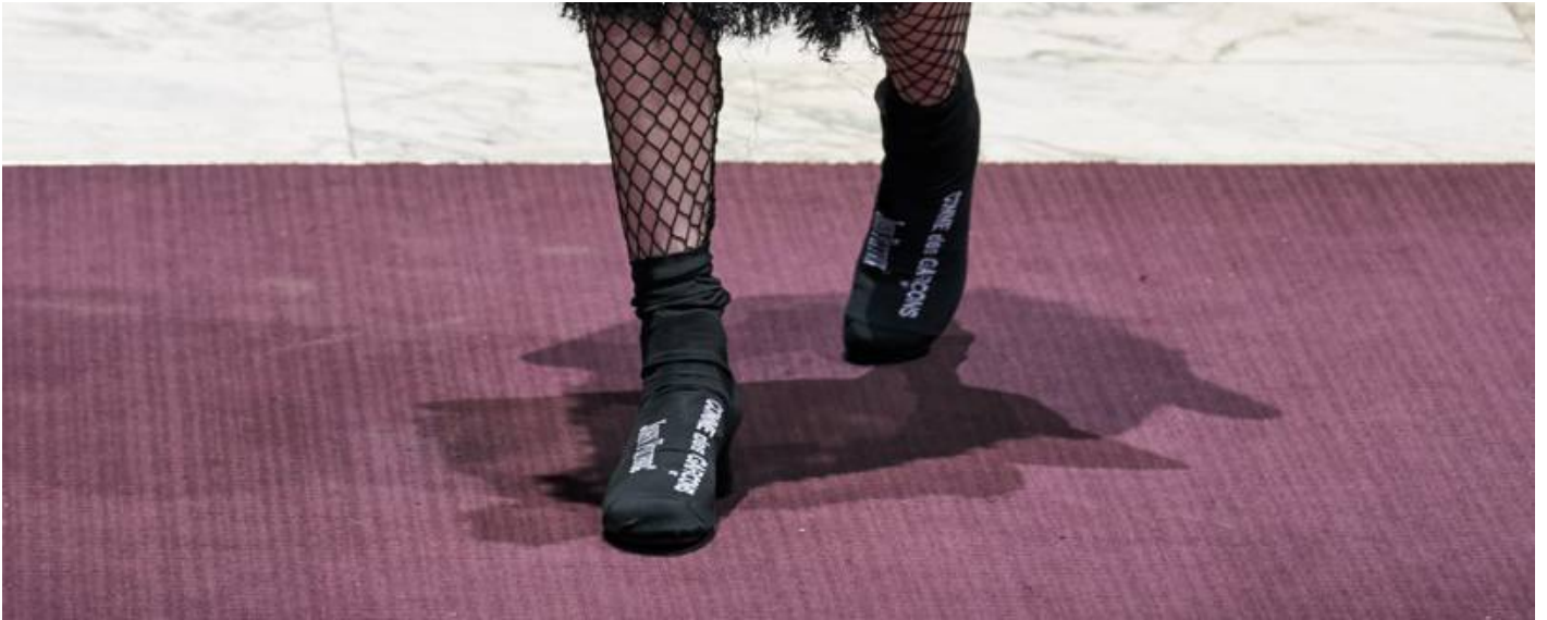
Comme des Garçons Autumn/Winter 2019