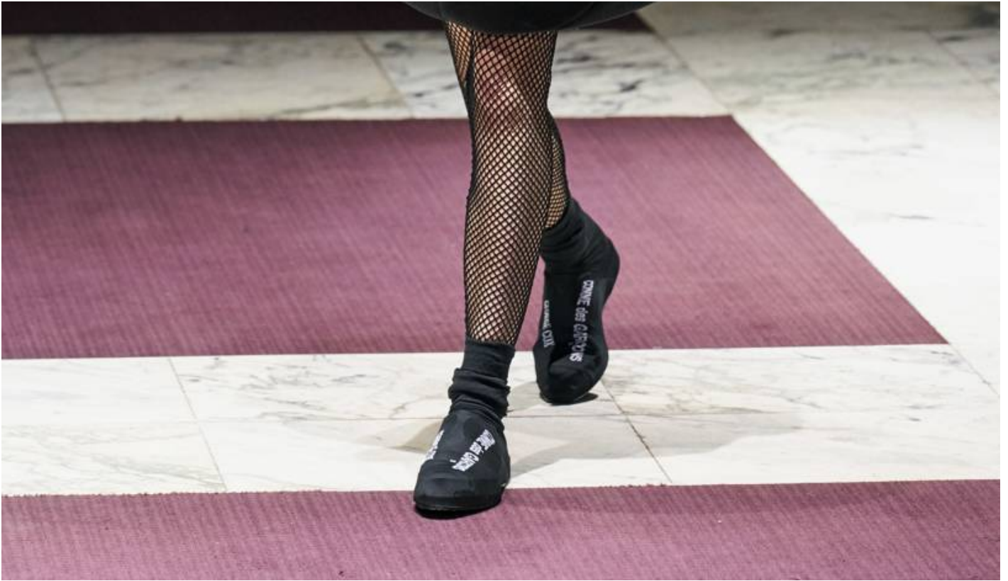
Comme des Garçons Autumn/Winter 2019