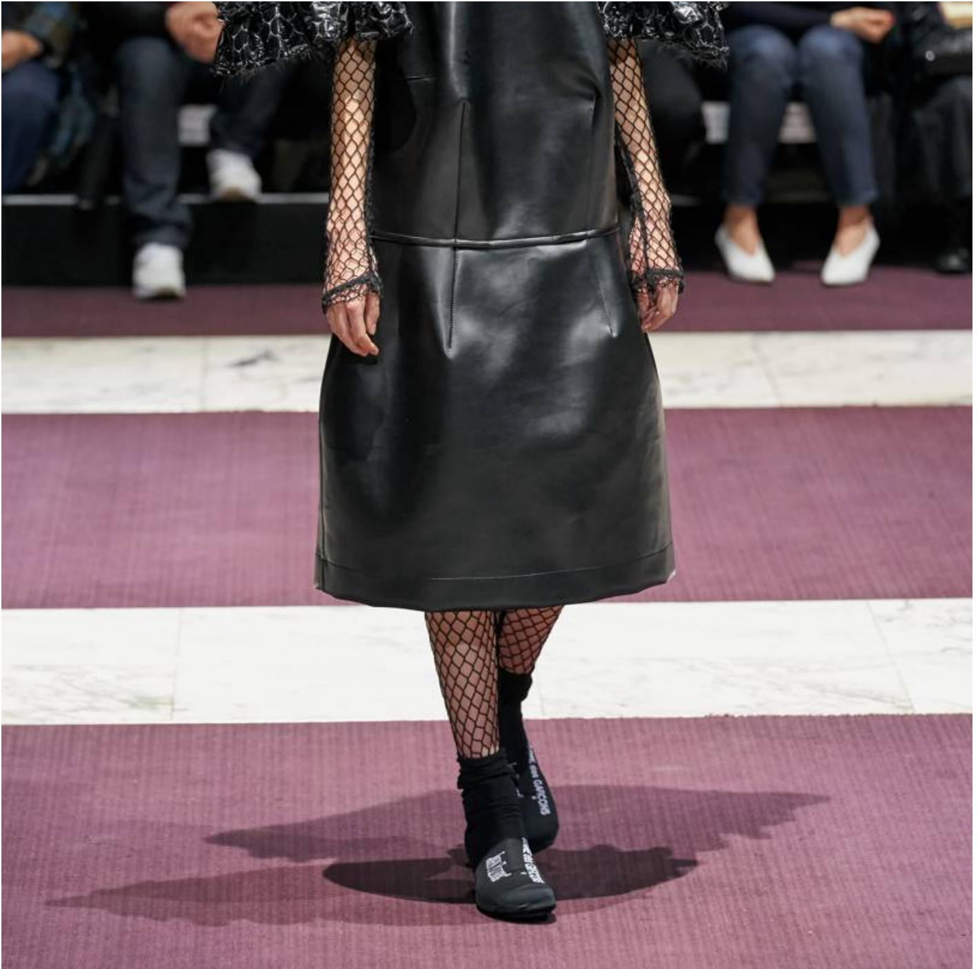
Comme des Garçons Autumn/Winter 2019